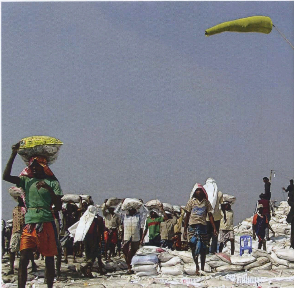
Global connections: 'Deep Weather', above, links Bangladesh and Alberta; below, 'Egyptian Chemistry'

Early shots depict the Toshka New Valley project as a compound of Ballardian hyper-realism, science-fiction lunar colony and eerie